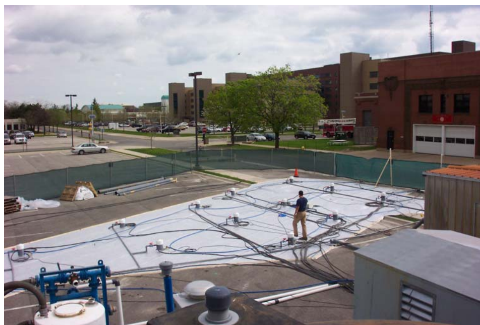
Figure 1. Site Layout

* The treatment regions are defined on Figure 2 “ERH Treatment Area and Depths” of the TtNUS RFP.