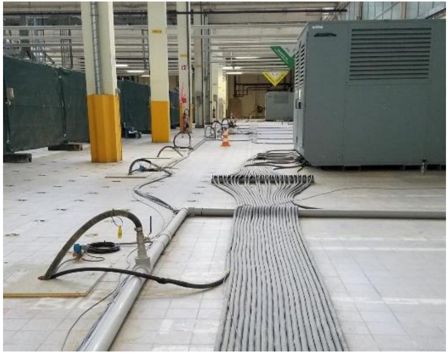
Figure 2. Thermal remediation under an active manufacturing facility.

TRS has treated many small sites where excavation was impractical due to the presence of buildings or other structures. We have safely treated near utility lines, under concrete floor slabs, and near foundations. An example is shown in Figure 2. By avoiding demolition of buildings, thermal remediation may be economical for small volumes.