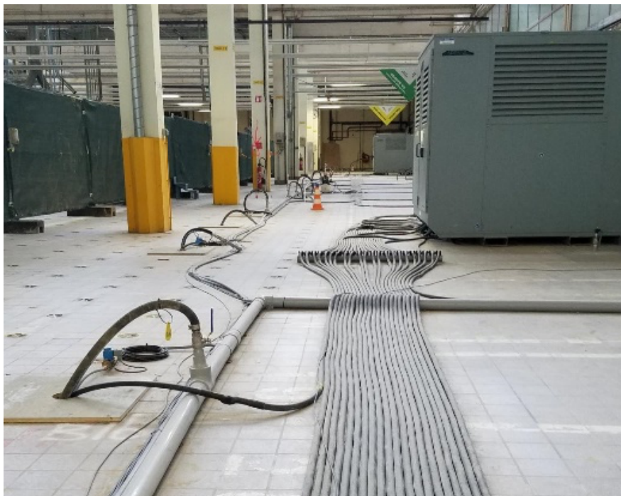
Figure 2: Thermal remediation under an active manufacturing facility

TRS has treated many small sites where excavation was impractical due to the presence of buildings or other structures. We have safely treated near utility lines, under concrete floor slabs, and near foundations. An example is shown in Figure 2. By avoiding demolition of buildings, thermal remediation may be economical for small volumes.